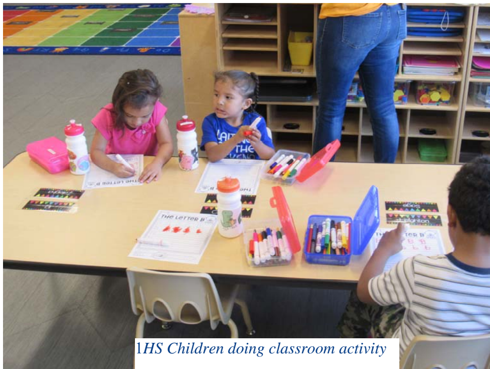
1HS Children doing classroom activity

Teachers are asked to meet with families in the home twice a year (once in the fall and once in the spring). Due to the COVID-19 pandemic the conferences were conducted over the phone. The teachers would discuss the development and learning progress of the child. They would record their comments and concerns and record the family's comments and concerns including suggestions for improving the program.