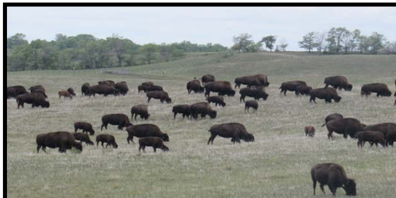
Scenic Spirit Lake

There were no Head Start Reviews this past year due to the impact of covid-19, travel restrictions and other barriers to conducting a thorough review by OHS. On-site Head Start Program Reviews are scheduled to continue during the late Fall months of 2022 and through 2023.