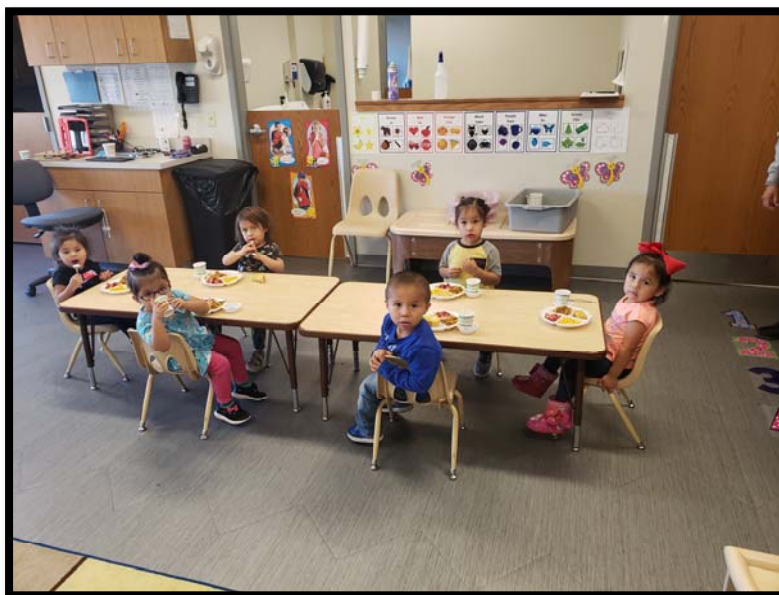
2Family Style Dining in EHS classroom